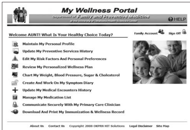
Figure 1. The main menu of the Wellness Portal.